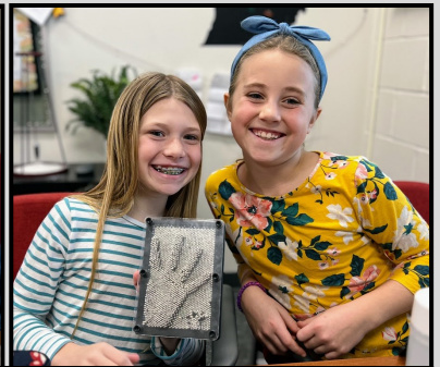
PBIS Lunch with the Principal!

We value: Trustworthiness Respect Responsibility Fairness Caring Citizenship