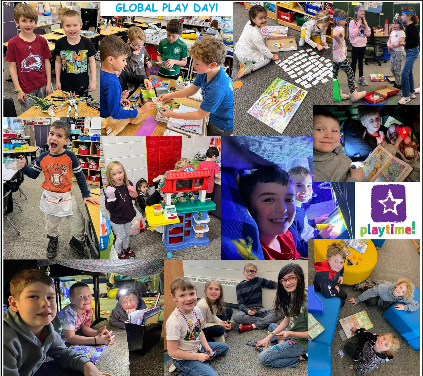
GLOBAL PLAY DAY!