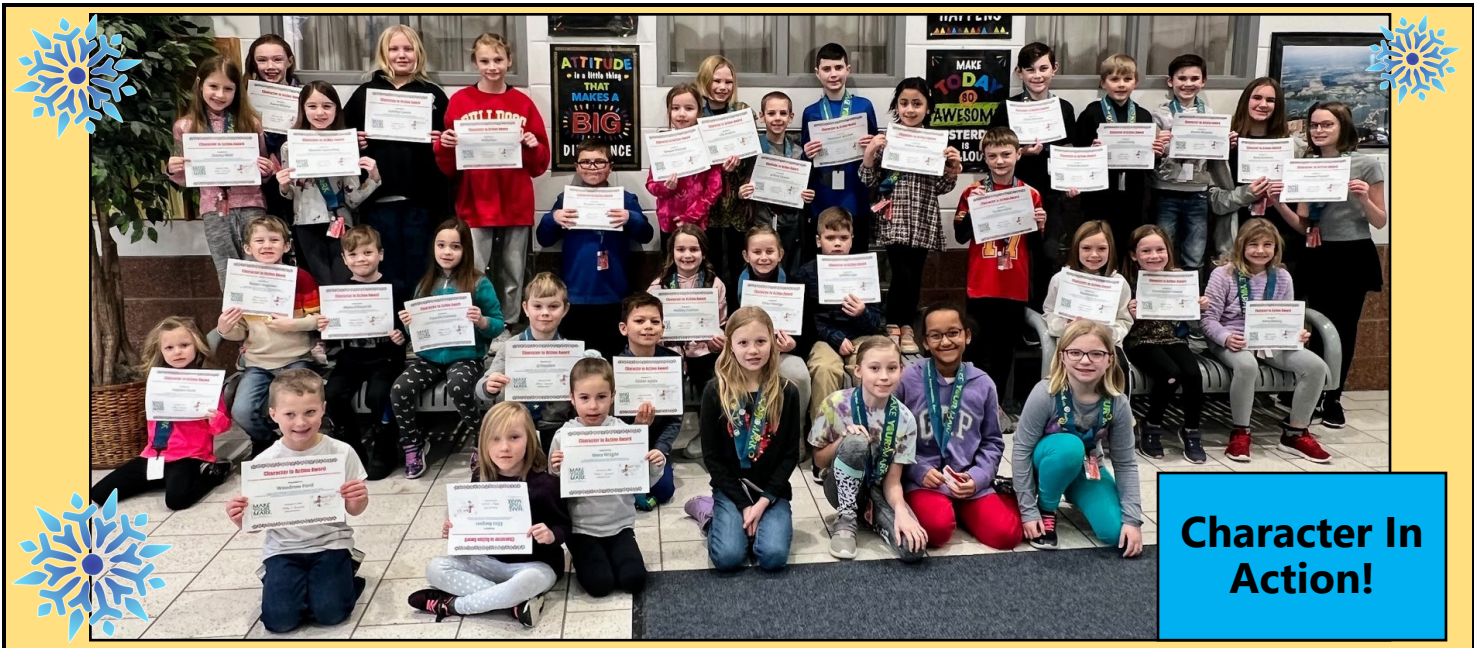
Character In Action!