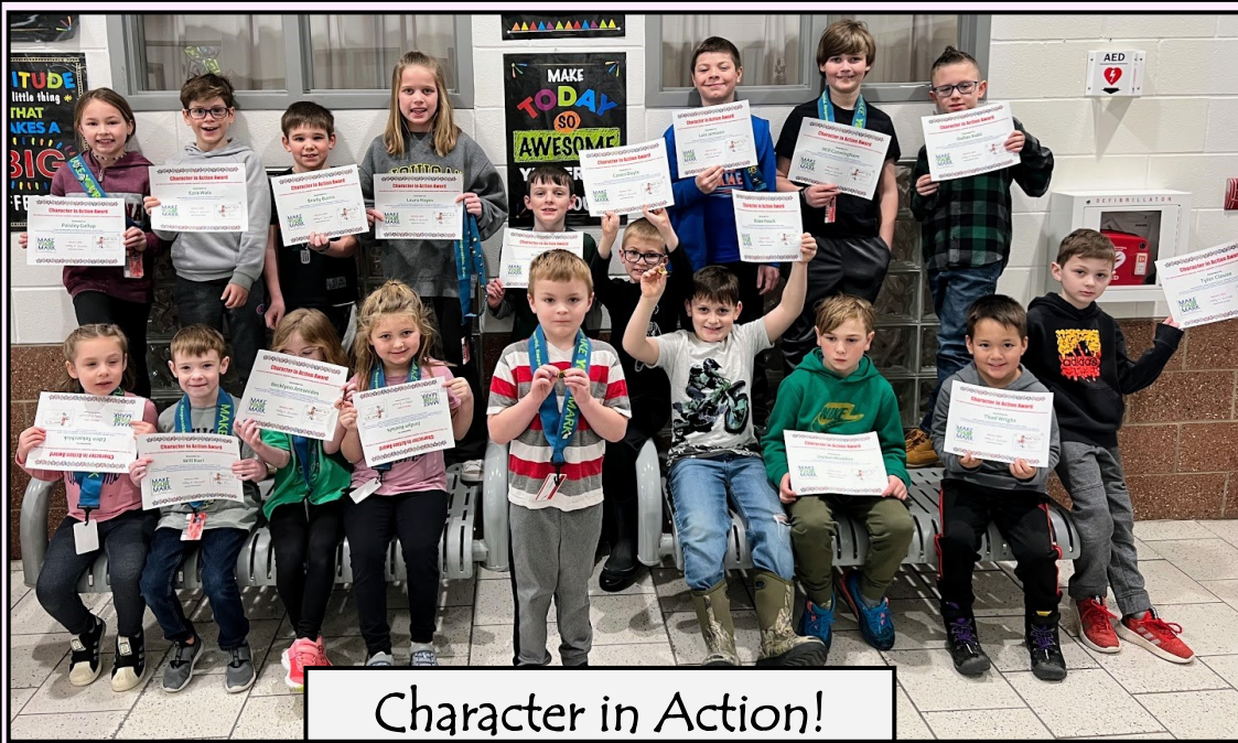
Character in Action!