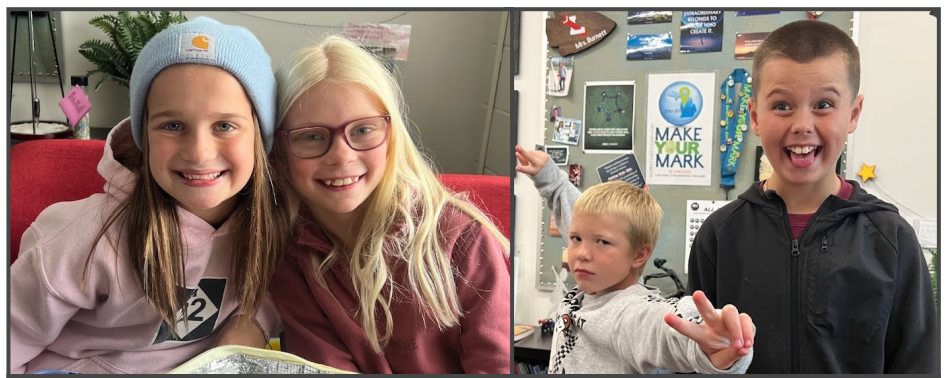
PBIS Lunch with the Principal!

Upcoming Events: Monday, October 16 Parent Teacher Conferences, 4:00-8:00 pm Wednesday, October 18 Lion Heart, 9:30-10:30 am Parent Teacher Conferences, 4:00-8:00 pm Thursday, October 19 Bright Beginnings Playgroup, gym, 9:00-10:30 am Friday, October 20 Cannon to WWC, 9:10 am-1:30 pm