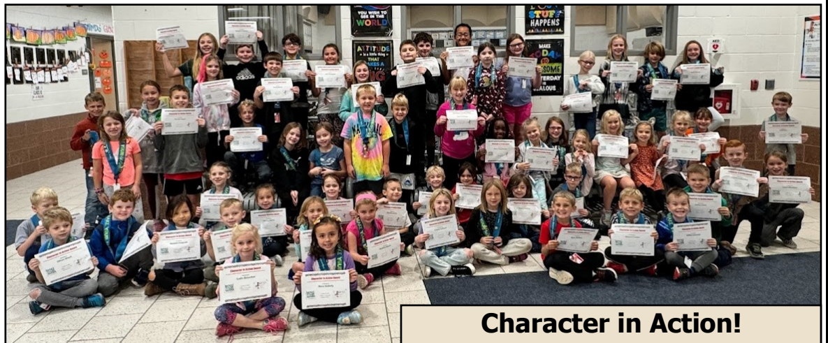
Character in Action!

We value: Trustworthiness Respect Responsibility Fairness Caring Citizenship