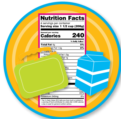
While Packing a Lunch