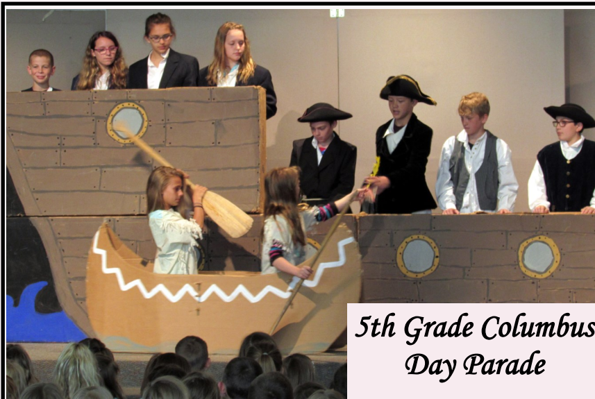
5th Grade Columbus Day Parade