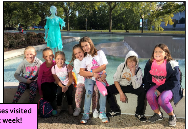
Our 4th gr classes visited ArtPrize last week!